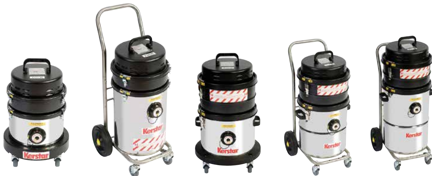
KAV 15H, 18H, 20H, 30H and 45H